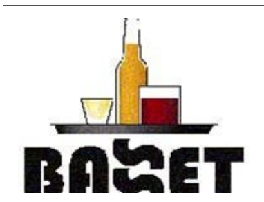
Training Servers to Sell Responsibly

The Beverage Alcohol Sellers and Servers Education and Training (BASSET) program is designed to encourage sellers/servers of alcoholic beverages to serve responsibly and stay within the law. Participants will receive 4 hours of instruction required for certification through