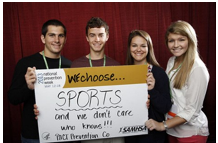
Your Voice. Your choice. Make a Difference.

CPASA is asking schools to consider participating in the "I Choose" Project, a way for them to make a difference, be a positive example and inspire others. Our local "I Choose" Project begins the week of March 25, 2013 and will continue through National Prevention Week, which takes place May 12 -18, 2013. We are inviting all junior high and high schools to allow interested faculty, staff and students to participate. CPASA will work with schools to schedule a convenient time for our photographer to come to your