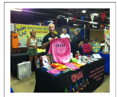
Selling CPASA T-shirts at the Bureau County Fair